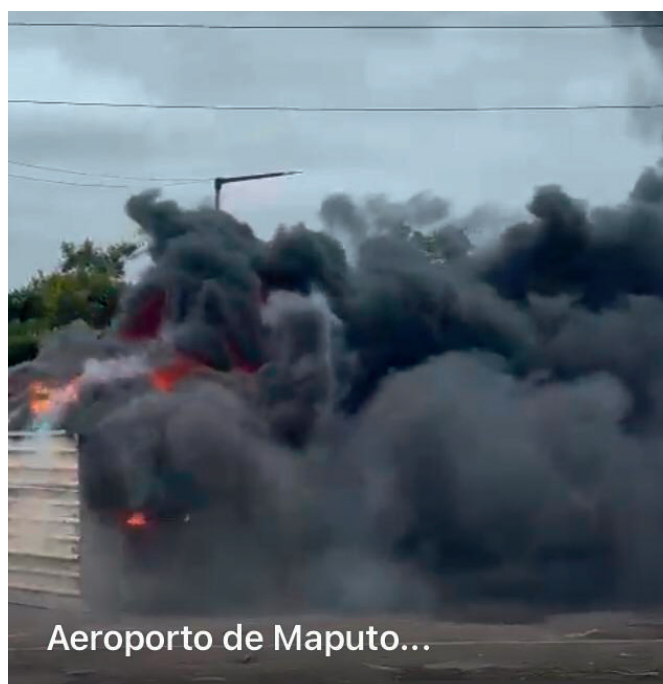
Aeroporto de Maputo...