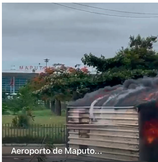
Aeroporto de Maputo...

The country also continues to record situations of destruction of public and private assets, and looting of stores, factories, and warehouses. Mozambique is experiencing the worst moment of its existence. The country is completely at a standstill. The skies are covered in black smoke from burning tires and public and private infrastructure. The floor is covered in blood. The State is absent.