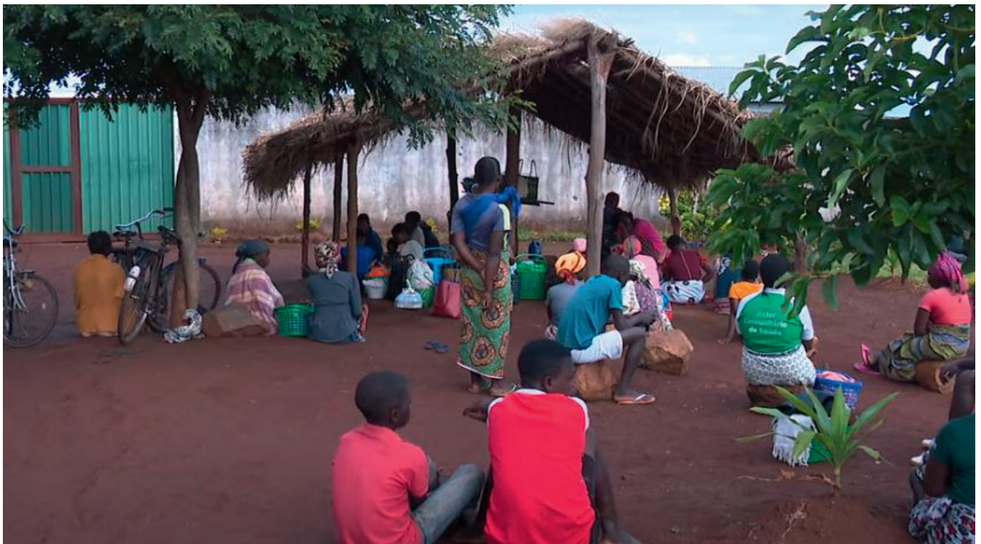
Some relatives of the inmates shot dead in Milange