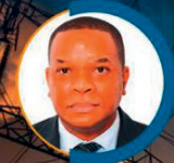
Teodoro Vales Ministry of Mineral Resources and Energy