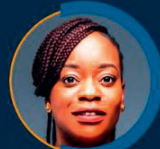
NneNne Iwuji British British High Commissioner