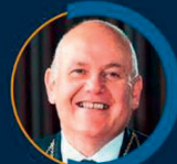
Barney Crockett Lord Provost of Aberdeen