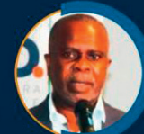
Florete Motarua Mayor of Pemba