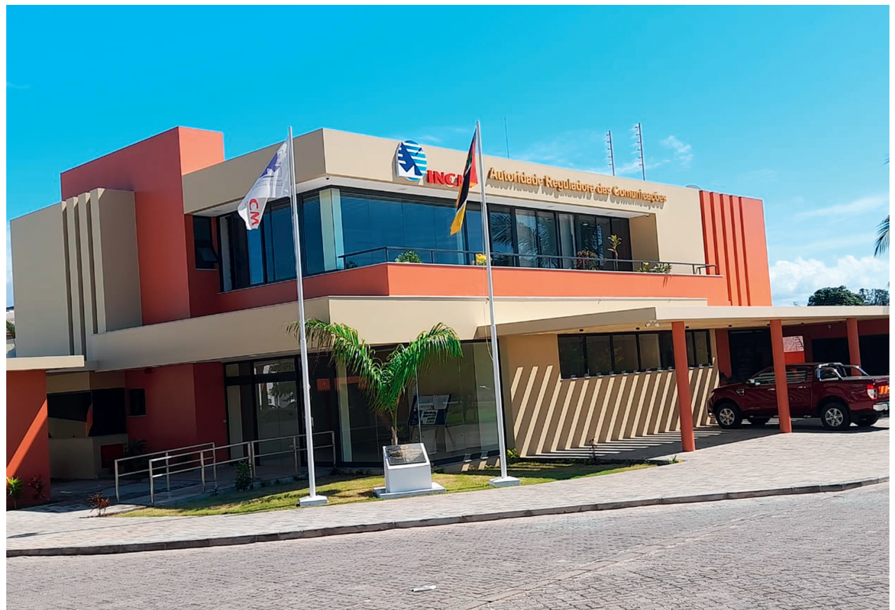
Other buildings sold by Ingilo Dalsuco to the State.

bican justice system should do is to nullify the deal for the purchase of the Inhambane Province Judicial Court building and investigate its details to determine responsibility. And more: the justice system should investigate all business deals in which the Mozambican State and CONSÓRCIO INVESTIMENOS IMOBILIÁRIOS, LDA and other companies linked