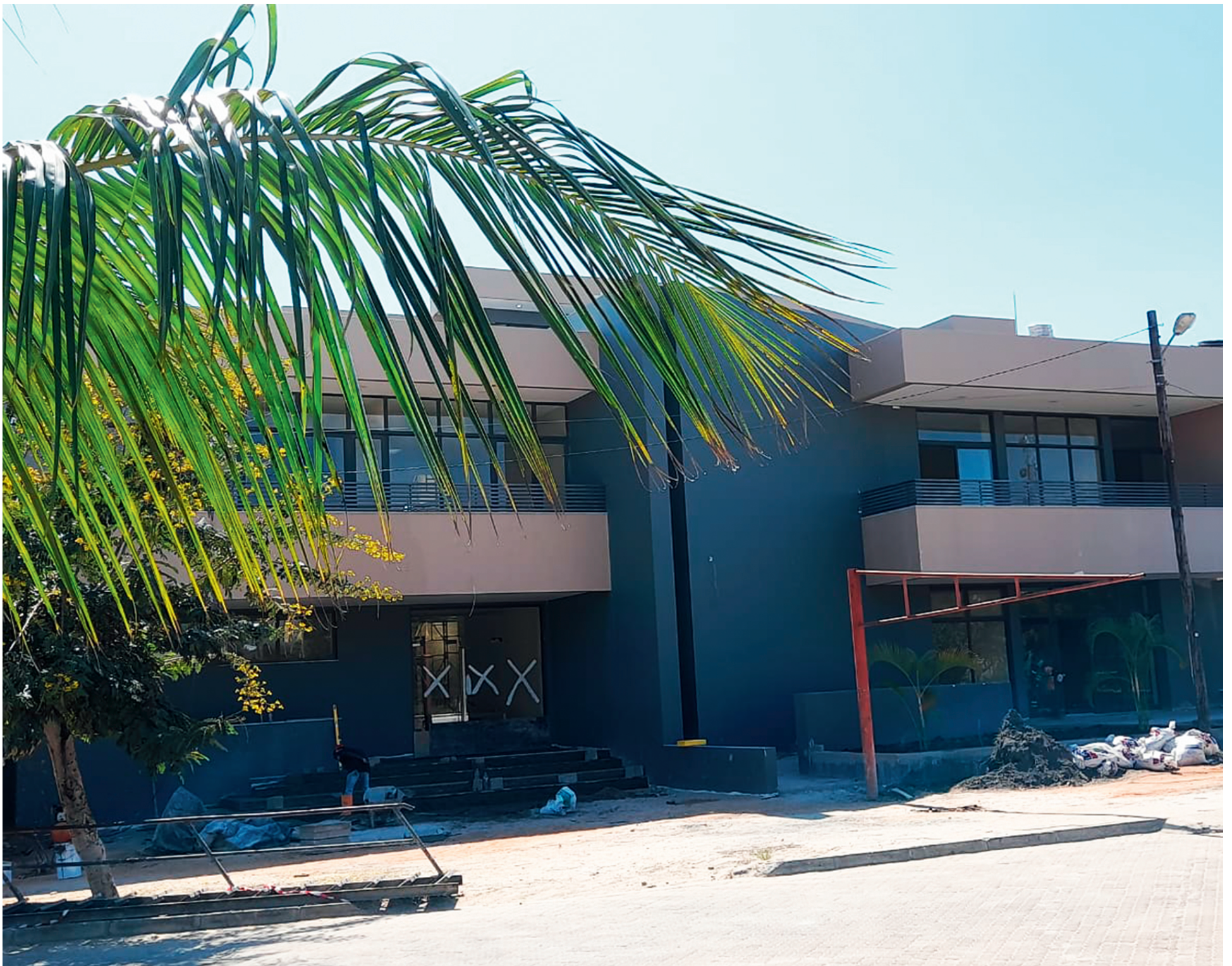
Building purchased for 4.2 million dollars.