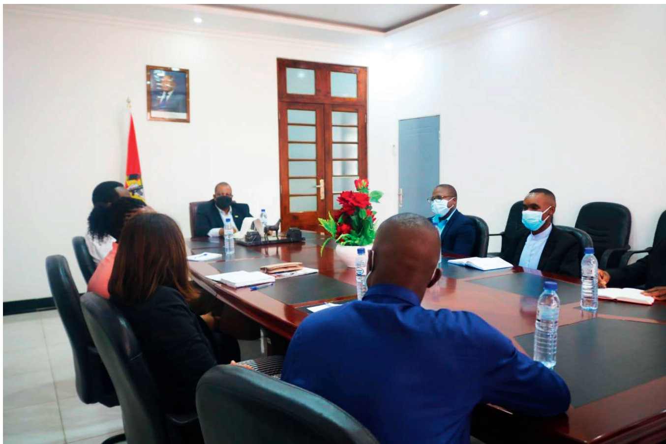
Courtesy meeting with the Governor of Nampula Province