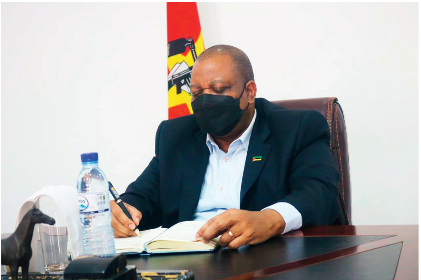
Governor of Nampula Province, Manuel Rodrigues

The Governor of Nampula welcomed the Social Cohesion Program and highlighted that it is coherent with the Five-Year Program of the Government (2020-2024) in the democratic participation component. According to him, the program can help correct the asymmetries in the northern region of Mozambique. The province of Nampula has the challenge of territorial extension and number of inhabitants. This is a challenge for the program, especially in terms of impact. Additionally, he highlighted that the context of implementation has complex social and political dynamics, especially given the relationship between the populations of the coast and the interior.