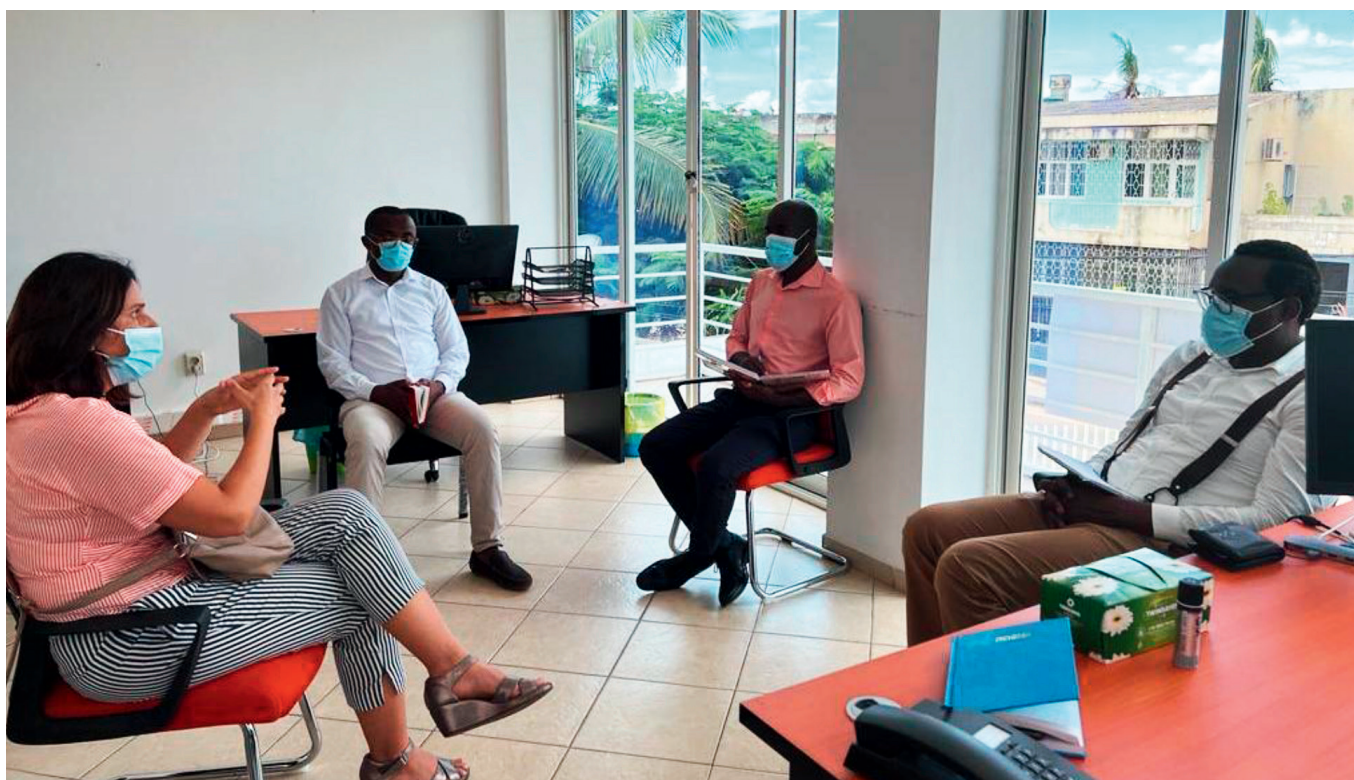
Courtesy Meeting with the German Cooperation Representative in Nampula