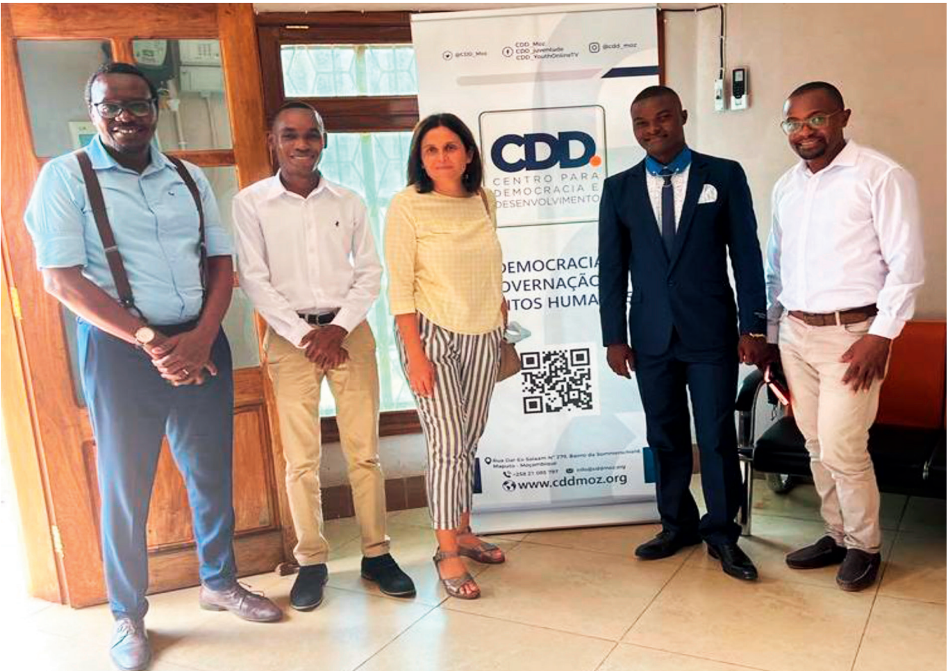
Cohesion Program partners pay courtesy visit to CDD Nampula offices