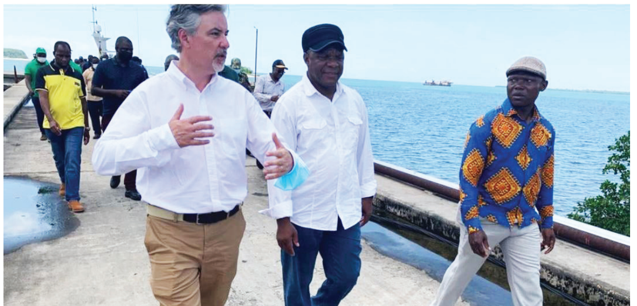
Accompanied by the Governor of Cabo Delgado, the Director of TotalEnergies in Mozambique visited the port of Mocimboa da Praia last Sunday