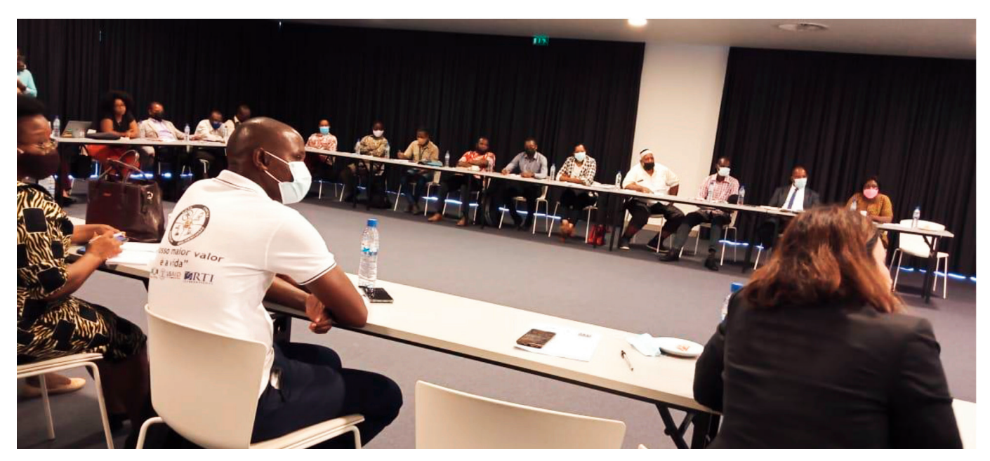
First Meeting of the Provincial Coordination Group, Pemba city