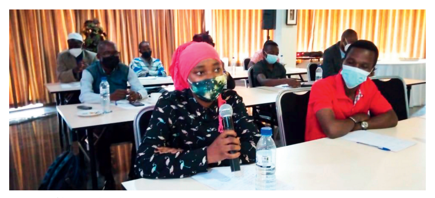
First Meeting of the Provincial Coordination Group, Niassa.

sa, the German Cooperation office in Niassa, and the We Effect. These meetings aimed to identify the lines of intersection between the Social Cohesion Program and other initiatives implemented locally.