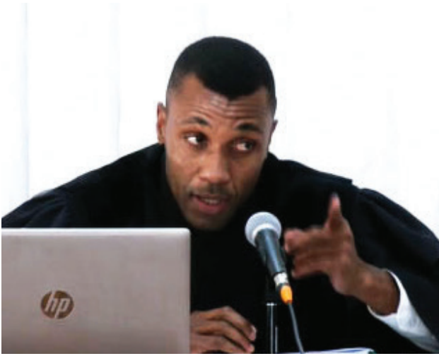
Judge Efigénio Baptista