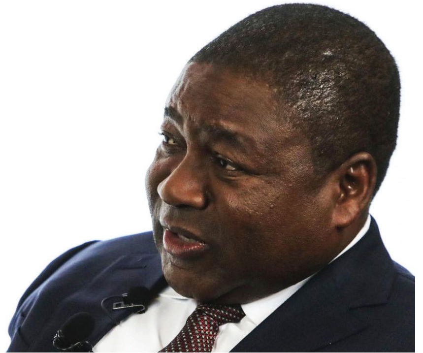
President of the Republic, Filipe Nyusi

ministerial decree aimed at earmarking revenue in favour of INAMAR (National Marine Institute), so that this entity would be the one to cover the costs arising from the exercise of coastal protection activities.