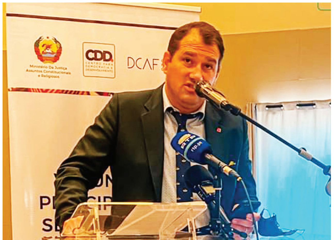
Representative of the Canadian High Commission in Mozambique

local governments, communities and the private sector in resolving complaints transparently and ensures that public and private security forces are acting in a responsible and proportionate manner."