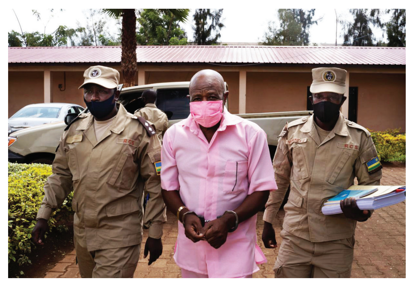
Paul Rusesabagina arriving at the Court of Justice in Kigali on 2 October 2020

In a non-binding resolution, the European Parliament strongly condemned the Rwandan justice's decision, describing it as "exemplary of human rights violations" in Rwanda. It called for Rusesabagina's immediate release on humanitarian grounds and urged the European Union Delegation to Rwanda,