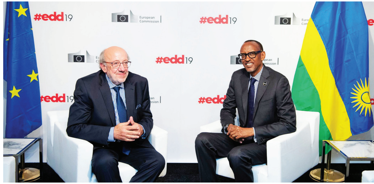
Paul Kagame with a Member (Louis Michel) of the European Parliament, June 2019

are ignoring term limits, defrauding or postponing elections, exploiting social grievances to gain and stay in power, arresting opposition figures, repressing the media, and allowing security services to enforce pandemic (COVID-19) restrictions with brutality"5.