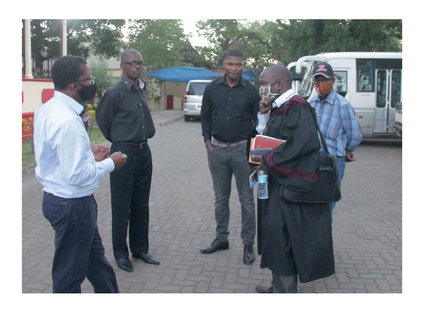
Text 3: COURT IGNORES REQUEST TO OBTAIN EXTRACTS OF THE PHONE