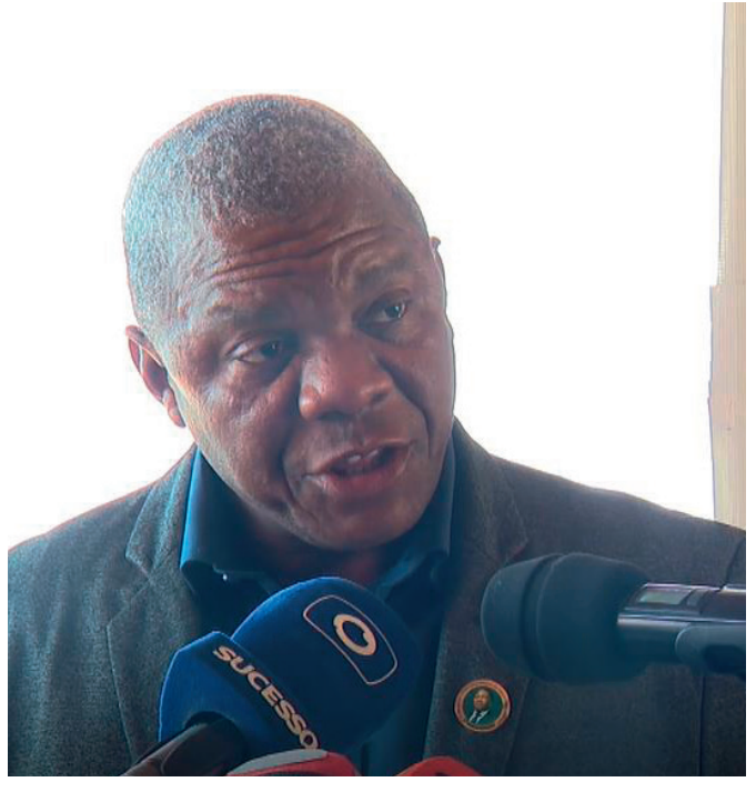
Valige Tauabo, Governor of Cabo Delgado Province

On May 17, the Council of Ministers approved the request for the allocation of 12,000 hectares of land located in Palma in favor of the CPD. The approval of the provisional DUAT in favor of the CPD was not preceded by a public consultation with the affected communities, as required by land legislation. And the public consultation could not take place due to the conflict that forced the populations of Palma to leave their areas of origin. In other words, the Government took advantage of the flight of communities affected by violent extremism to expropriate their lands.