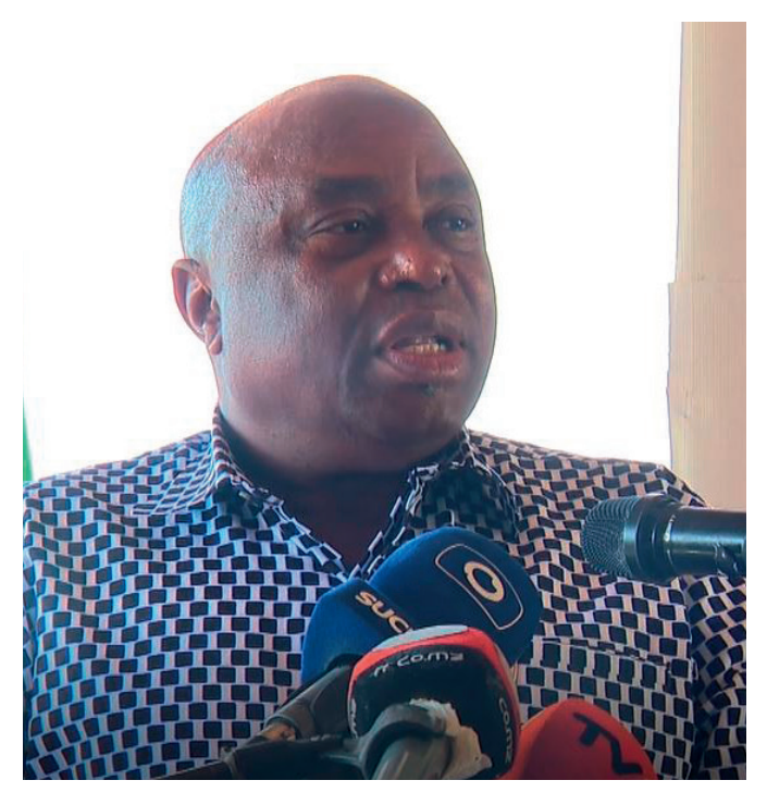
António Supeia, Secretary of State for the Province of Cabo Delgado

t was at the 16th ordinary session of the 17th of May that the Council of Ministers approved the Resolution that provisionally authorizes the request for the Right to Use and Benefit of Land (DUAT) formulated by the Cabo Delgado Economic Development Promotion Center referring to an area of 12,000 hectares, located in the District of Palma, Province of Cabo Delgado. The statement from the Council of Ministers did not specify the purposes for which the area allocated in a context of conflict to an entity until now unknown.