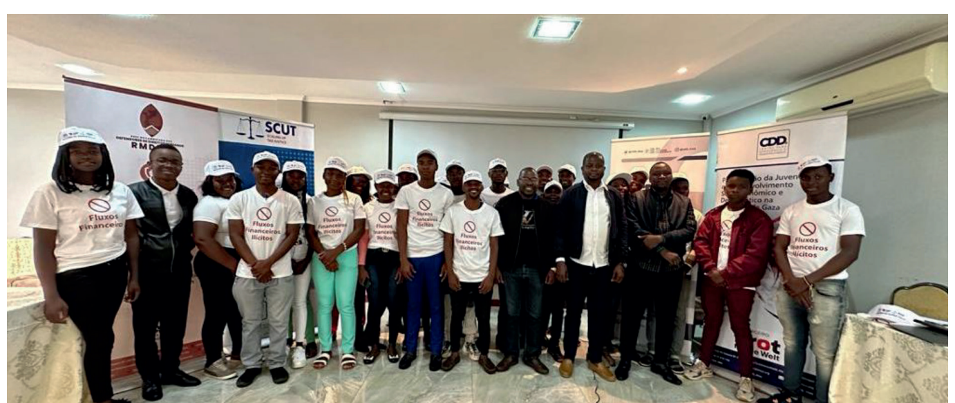
Youth Hub of Chibuto, Gaza province

The training series had as its thematic focus the promotion, respect and defense of human rights. However, diverging from traditional approaches to the topic, which have given greater attention only to civil and political rights, the series of training promoted reflections on the role of young people in influencing governance processes and their relationship with the State within the scope of "social contract" existing to ensure the realization of their economic and social rights as a primary condition for improving their living conditions.