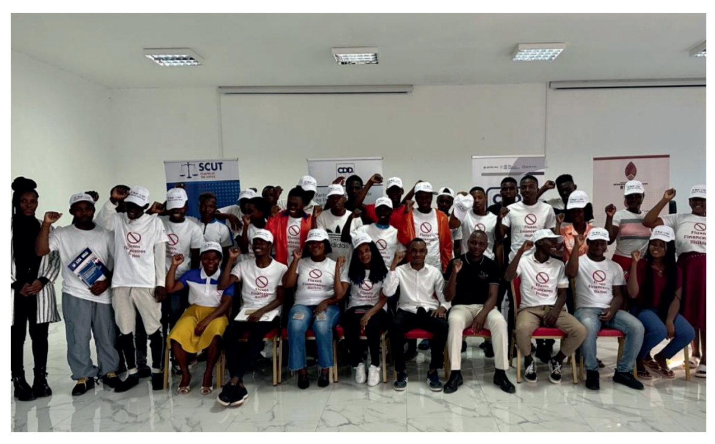
Youth Hub of Massingir, Gaza province

"Tax justice is also a Human Rights issue." This is one of the key messages that was highlighted in the series of trainings for young people from the Youth Hubs as new Human Rights Defenders and Social Justice Leaders. The series of training took place in the districts of Chibuto, Manjacaze and Massingir, in the province of Gaza, between the 1st, 2nd and 3rd of November.