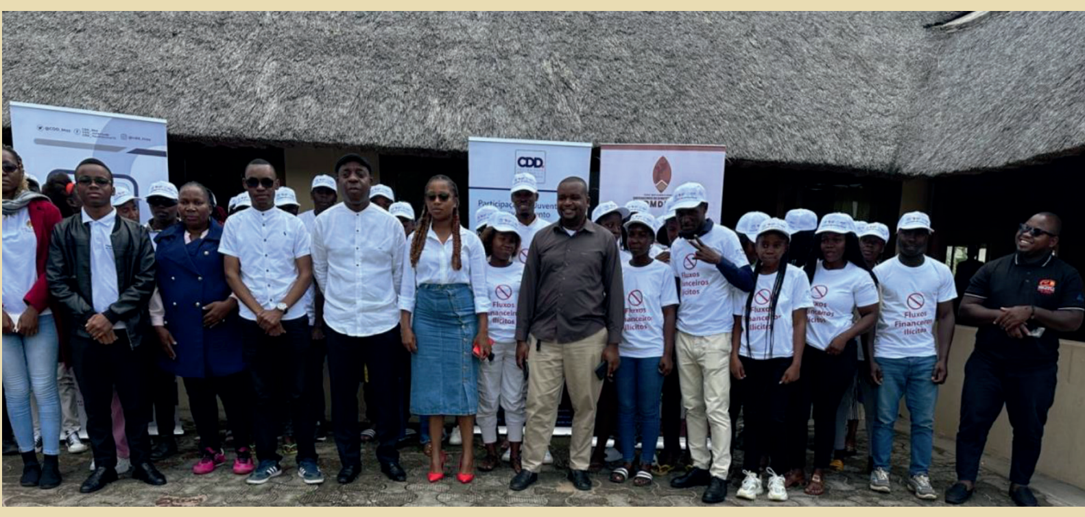
Youth Hub of Manjacaze, Gaza province