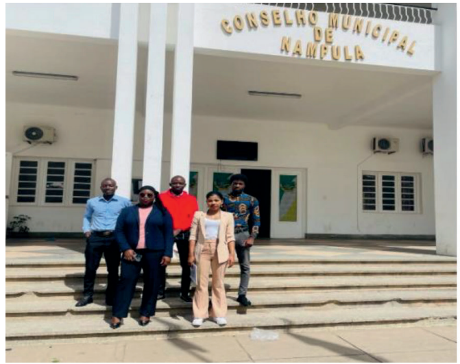
ALT family photo

This event reinforced young people's knowledge about the functioning of local authorities, namely how the municipality is managed and the supervision carried out by the Municipal Assembly. It was an experience for young people to raise their awareness of the importance of citizenship and participation in local development processes.