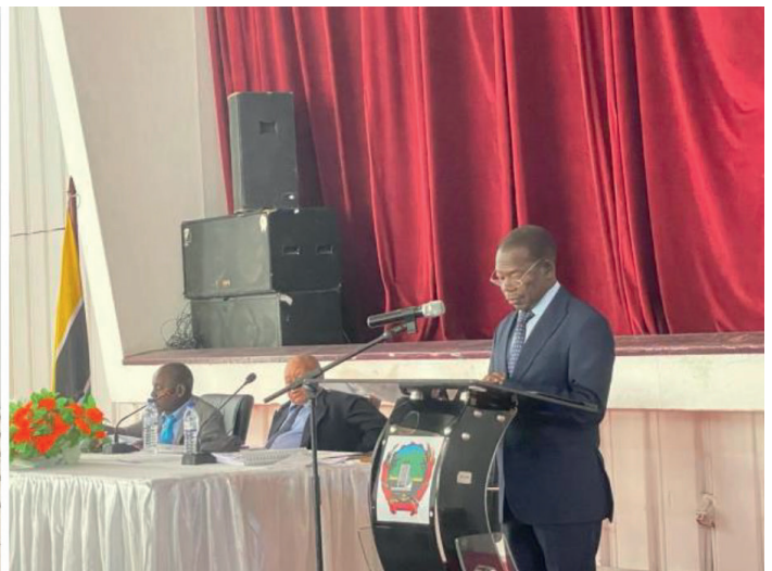
Paulo Vahanle, Mayor of the city of Nampula