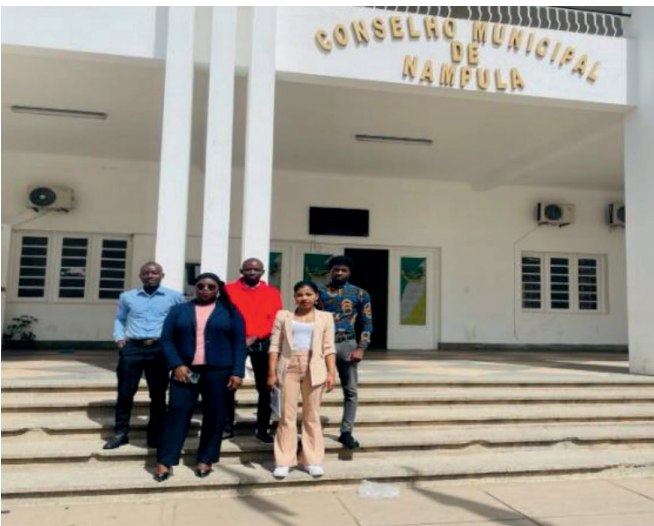
ALT family photo

This event reinforced young people's knowledge about the functioning of local authorities, namely how the municipality is managed and the supervision carried out by the Municipal Assembly. It was an experience for young people to raise their awareness of the importance of citizenship and participation in local development processes.